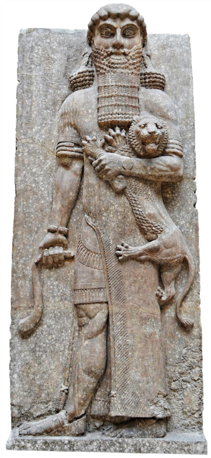
Hero mastering a lion. Relief from the façade of the throne room, Palace of Sargon II at Khorsabad (Dur Sharrukin), 713–706 BCE.